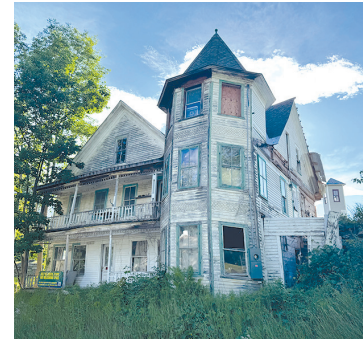
The deteriorating house on the Melendy property in South Londonderry.

Businesses and individuals willing to donate equipment, trucking, landscaping services, or other assistance are encouraged to contact Pete Cobb at 802-275-2166 to be added to the volunteer and donor list.