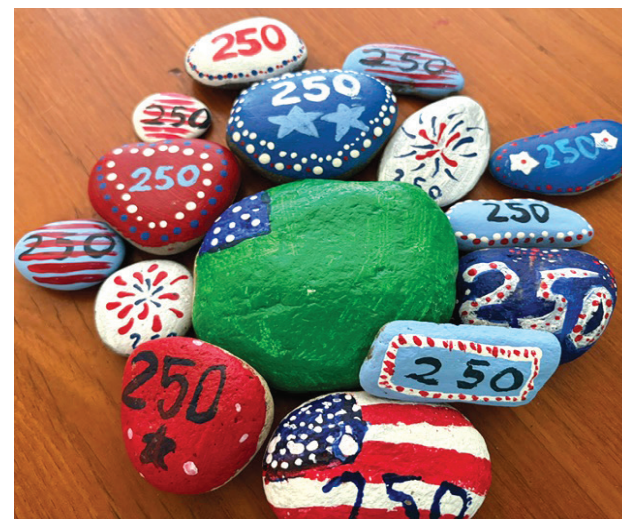
Rocks decorated in Cavendish for America's 250th anniversary.

Independence Day celebrations in Claremont begin on Friday, July 3, from 1-5 p.m., with a block party on Pleasant Street in downtown Claremont. The celebrations