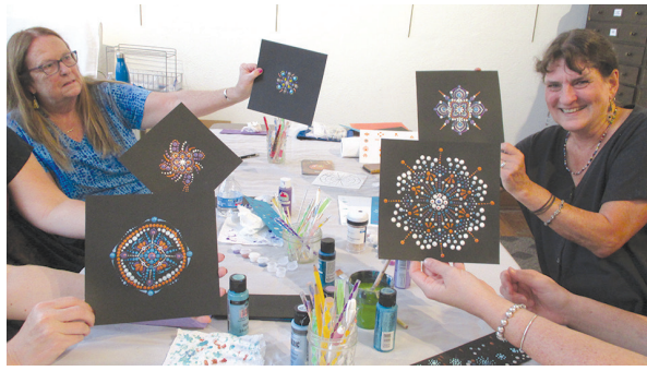
Aniji dot mandalas.

Once ready, you will be provided with an 8-inch by 8-inch sheet of heavy card stock in a variety of colors, on which the center is already marked for the placement of the first dot. You will be given a strip of six small paint pots, and can choose from a variety of acrylic paints. This is a very