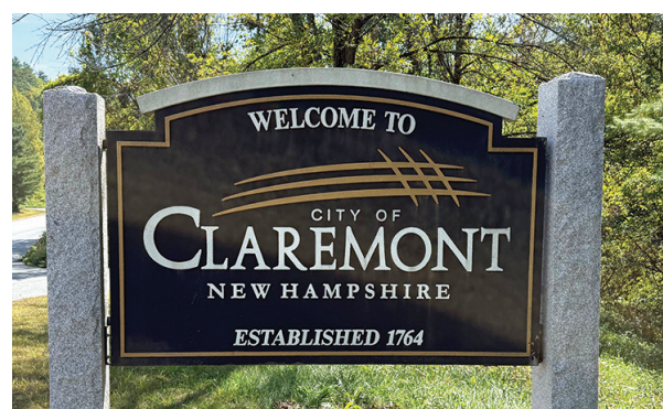
City of Claremont. PHOTO PROVIDED

Bates also reviewed the preliminary draft report from the engineers on the