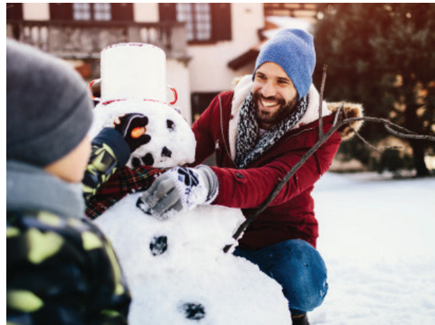
Winter homebuying has its advantages.

Less competition – Fewer people looking for homes means fewer buyers to com-