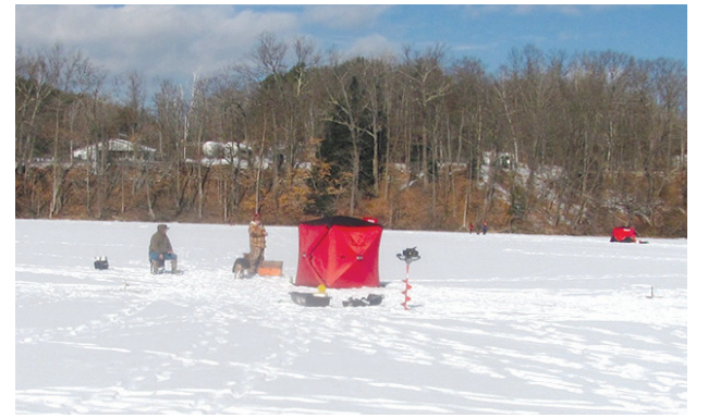
Notice the tent shelter in center. To the right the auger is grounded. Two men at left jig for panfish.

The sun was bright and warm. We saw a family on the ice with their young