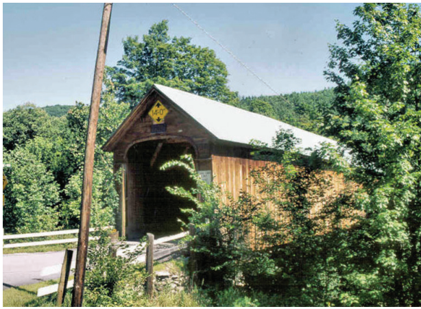
The Hall Covered Bridge, situated on the Saxtons River.

"It's true...I had never seen a covered bridge before, not even the movie 'Bridges of Madison,' and when I first drove past one in Brattleboro I thought, 'that's interesting'... and a few days later I passed by the bridge in Dummerston and thought, 'different style, different color and length'...and on the way