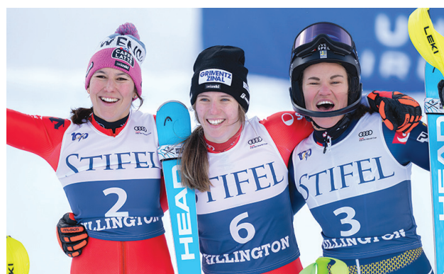
Slalom first place Camille Rast, tied with second place Anna Swenn Larsson, third place Wendy Holdener.

With Shiffrin out of contention on Sunday, Paula Moltzan was the only member of the U.S. Ski Team to make it to the second run. However, she crashed in her second run and did not finish. Rast took her first career World Cup win in the slalom event, with Anna Swenn Larsson, of Sweden, in second, and Wendy Holdener, of Switzerland, in third.