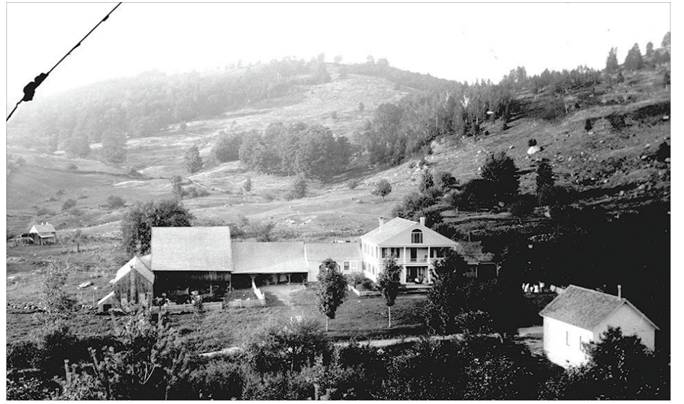
The Fletcher Female Seminary circa 1910, now a private residence. District School No. 2 in the foreground. Notice the broken glass plate.

"The building is well arranged for the accommodation of scholars a number of rooms will be occupied by two only, others by four. It is located in a very retired place and favorable