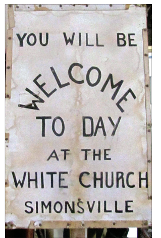
An old welcome sign for the White Church in Simonsville, mentioned in this history.

fireplaces, Christian doors, and the third-floor ballroom. A double porch now fronts the first two floors, with a third smaller porch opening from the ell. In early automobile days, this inn was a stop-over on the 'Ideal Tour' between Manchester, Vermont and the White Mountains of New Hampshire. "The Little Red Schoolhouse , 24.3 m., would serve to illustrate the well-loved song of that name, and brings memories of all the sentimental songs and poems dealing with rural schooldays. "The Parsonage , 25 m., stands in the attractive sturdiness of red brick, made locally in Simonsville, and is early nineteenth century, having been used as a parsonage since its construction. "Between Simonsville and Chester, State 11 winds along an upland river valley, crossing and recrossing the rocky branch stream of