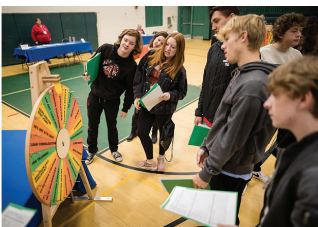
Students spin the Reality Wheel.

TOWNSHEND, Vt. – Brattleboro Development Credit Corporation’s Pipelines and Pathways Program has partnered with Leland & Gray High School to host the third annual Reality Fair on Thursday, Oct. 3. The Reality Fair is an interactive, hands-on experience that covers financial literacy and practical life skills all students need to confidently take their first steps into the adult world. Over 250 juniors and seniors from Windham County schools will participate in the event.