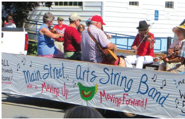
Main Street Arts String Band will play in Saxtons River Park.

The string band meets at MSA every Wednesday, from 5-6:30 p.m., and welcomes string players of any level of proficiency to sit in on their sessions.