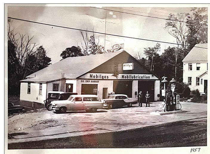
Photo of the old gas station.