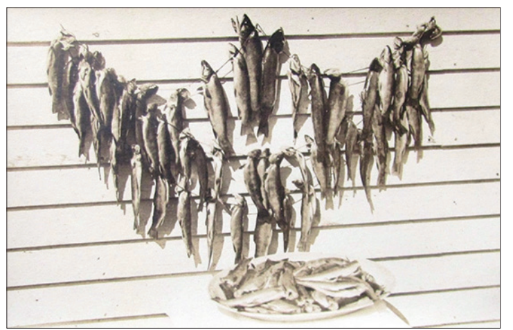
Trout caught by two Windham men, circa 1907.

The trout I lightly sprinkle with flour. Try not to get flour on the inside. In a cast iron skillet I heat butter, not olive oil. When the skillet is hot enough, drop the trout in. You'll notice fresh caught trout curl up in the skillet. Turn them over for another two minutes or so. I like the skin and tails crunchy. They really are a delicacy. A slice of warm strawberry rhubarb pie with vanilla ice cream on the side is a happy ending. I'm not a pie maker.