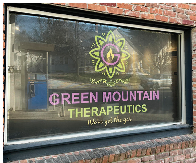
The front of Green Mountain Therapeutics.

Inside the dispensary last week, D’Elia-Laskin pointed to the watermark remaining on one unfinished section of wall – 4 feet up from the floor. The flood heavily damaged the walls, floor, shelving, and cabinets, which all had to be replaced.