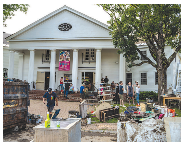
Cleanup underway at the Weston Playhouse.

Written by Huntley Financial Services, Ludlow, Vt., 802-228-5774.