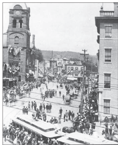
Main Street in Bellows Falls showing the old town hall.

Part scavenger hunt and part history lesson, all anyone needs to play is a cell phone. Bellows Falls in Time begins in front of the library by texting "Hello" to a number, or scanning a QR code, both available at the library, to start receiving messages from someone lost in time who