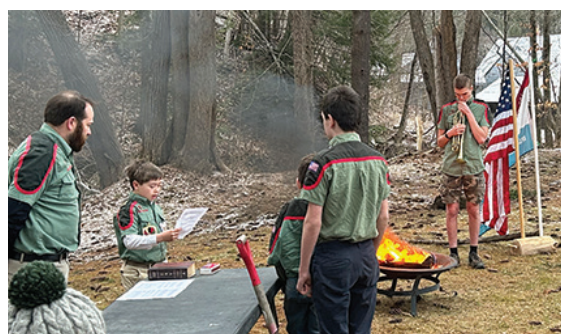
Troop 0136 members demonstrate a proper flag retirement.

BROWNSVILLE, Vt. – Flag retirement ceremonies hold a profound significance in American culture. They are not just a procedure for disposing of a worn-out flag; they are a respectful tribute to an emblem that symbolizes the nation's values, history, and sacrifices. A flag retirement ceremony is conducted to ensure that Old Glory, as the