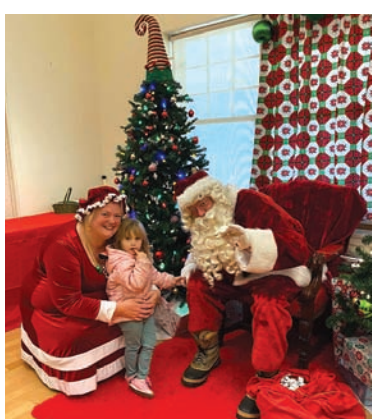
Santa and Mrs. Claus will be at the SAPCC event hall on Dec. 9.

This event is a fundraiser for Springfield Area Parent Child Center, where building bridges of support for young children, families, and caregivers is priority. Last year, the organization reached over 12,000