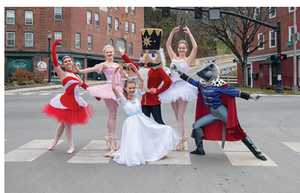
The cast of "The Nutcracker" at the Dance Factory.

A true community event, the Dance Factory partners with lo-