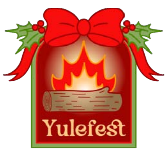
Saxtons River Yulefest, Dec. 3. PHOTO PROVIDED

Smokin' Bowls will be set up for family-friendly supper dishes such as mac and cheese.