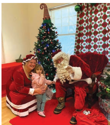
Santa and Mrs. Claus will be at the SAPCC event hall on Dec. 9.

This event is a fundraiser for Springfield Area Parent Child Center, where building bridges of support for young children, families, and caregivers is priority. Last year, the organization reached over 12,000