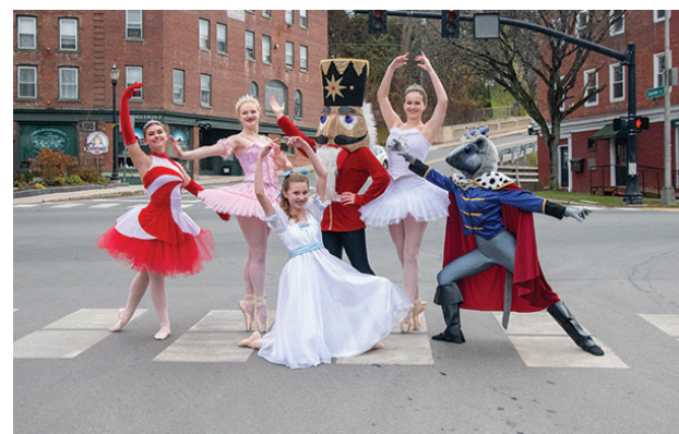
The cast of "The Nutcracker" at the Dance Factory.

A true community event, the Dance Factory partners with lo-