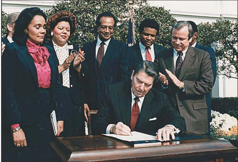
Coretta Scott King (far left) looks on as President Ronald Reagan signs legislation establishing Martin Luther King Jr. Day in 1983.