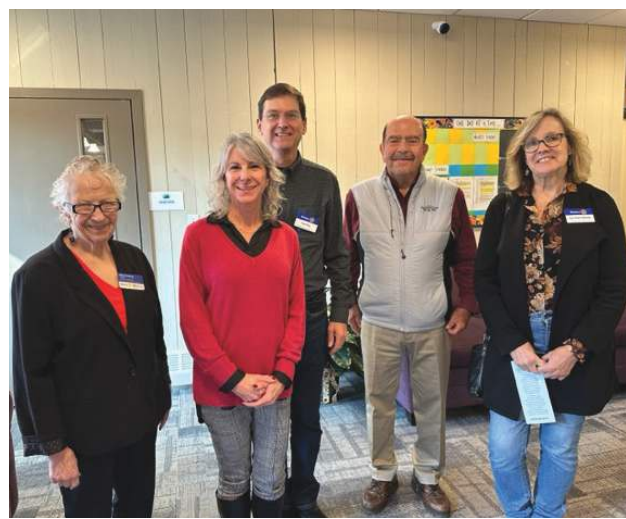
Ludlow Rotary members tour the Divided Sky facility.

“Trey Anastasio of the band Phish founded the Divided Sky Foundation. As a person in recovery, he recognizes the need for holistic services to heal and start a new and better way of living. They raised over one million dollars for the foundation with The Beacon Jams collective of shows during the pandemic. At The Divided Sky Resi-