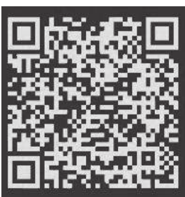
Scan to donate or purchase tickets.

E911 address sign. Properly displaying your E911 number is important in the event of an emergency. A properly displayed number allows first responders to get to you faster, and that could be a matter of life or death. Contact the Ludlow Planning and Zoning Office at 802-228-2845 to obtain your E911 address sign.