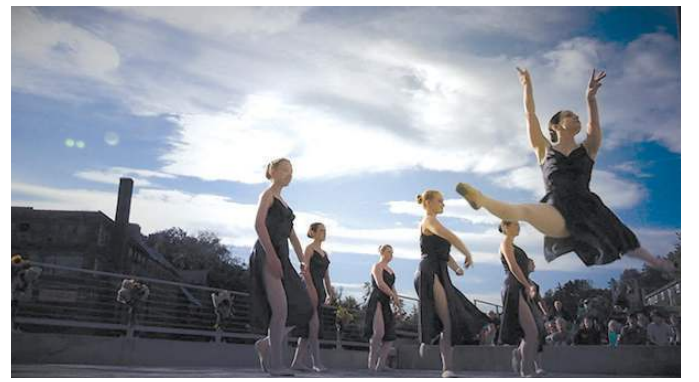
Performers with Avant Vermont Dance perform the last entry in the SEASONS series.

Spectators are encouraged to enjoy Springfield’s entire Downtown Holiday Program, including Springfield on the Move’s sticker walk at 4 p.m., music by the Springfield Community Band at 5:30, and Springfield Chamber of Commerce’s tree lighting and visit from Santa at 6 p.m. Set in various outdoor locations across Springfield’s historic downtown, Avant Vermont’s yearlong “SEASONS”