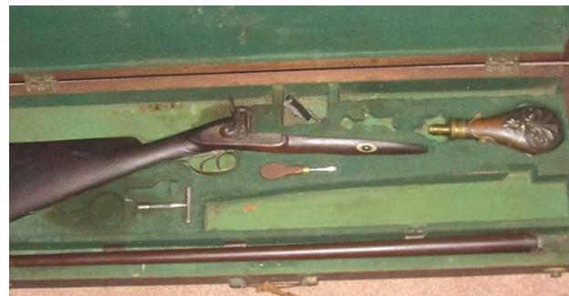
Cased percussion 12-gauge shotgun.