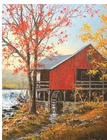
A painting of the Weston Mill. PHOTO PROVIDED

Established in 2009, DaVallia has been a five-star destination for the arts. Located on Route 103 in the historic Stone Village