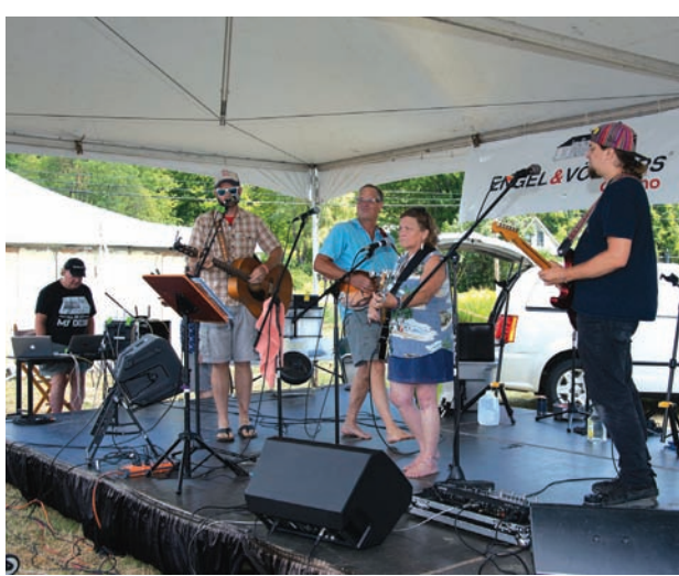
2022 festival music.