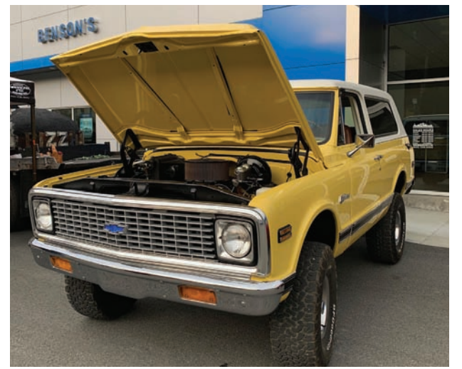
The annual Cruise-In will kick off the Best of Vermont Summer Festival on Friday, Aug. 25 at Benson's Chevy.