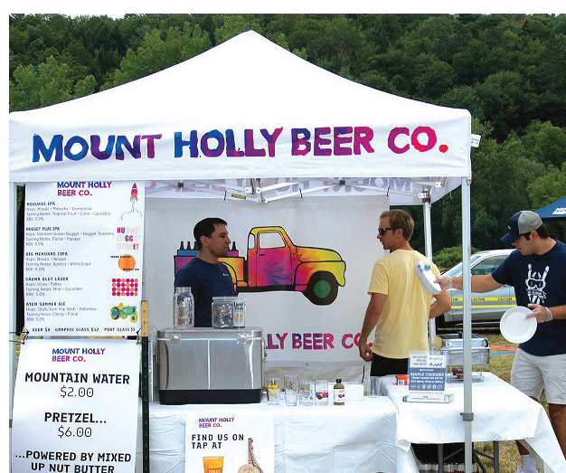
Mount Holly Beer Co. to be at the festival this year.

AUGUST 26-27 // SAT 12-7 PM // SUN 10 AM - 4 PM