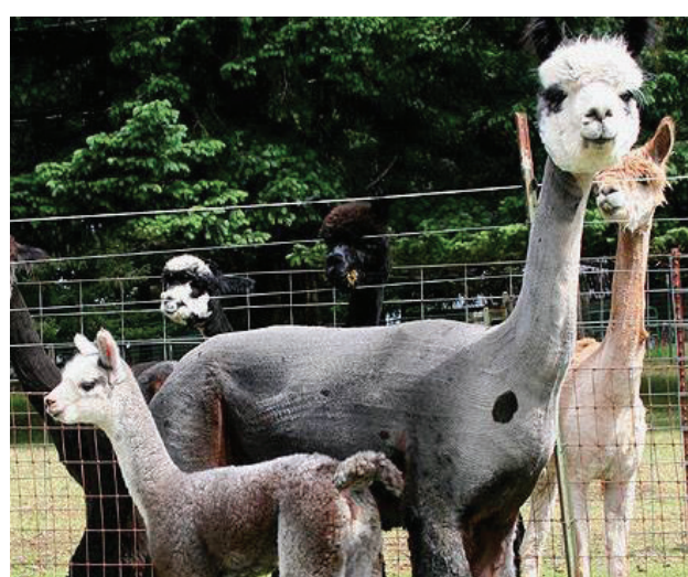
Alpacas to attend the festival this year!