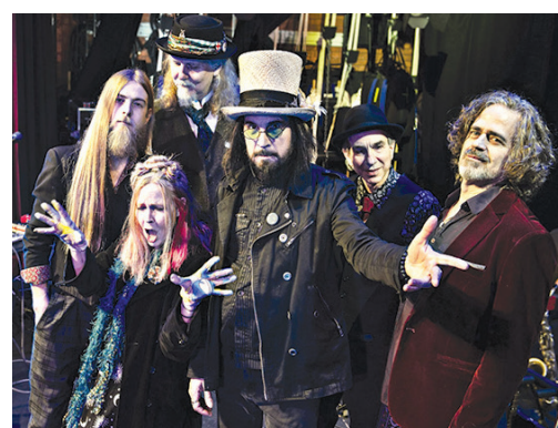
The Slambovian Circus of Dreams.

PUTNEY, Vt. – The Next Stage Bandwagon Summer Series and Twilight Music present acoustic-electric, folk-pop, Americana sextet The Slambovian Circus of Dreams on Sunday, Sept. 3, at 5 p.m., at the SVG Multipurpose Field in Bellows Falls, Vt.