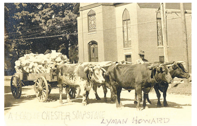
A load of Chester Soapstone weighing 7 tons.

When the people of South Street reached the conclusion that Steamer Aid No. 1 had reached the end of its usefulness and decided that a reservoir was needed for fire protection and to supply the village with a water supply, W.O. Davis was one of the prime movers in putting